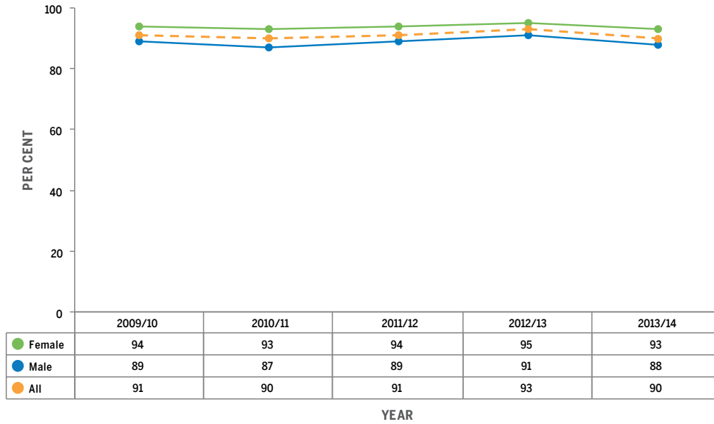
FIG 49.1 Percentage of Students in Grade 10 Who Pass the English Provincial Examination, by Sex, BC, 2009/10 to 2013/14

Notes: "Pass" means a grade of 'C-' or better. See Appendix B for more information about this data source. Source: BC Ministry of Education, Grade 10 English Provincial Exam Results, 2009/10-2013/14. Prepared by the Surveillance and Epidemiology Team, BC Office of the Provincial Health Officer, 2016.